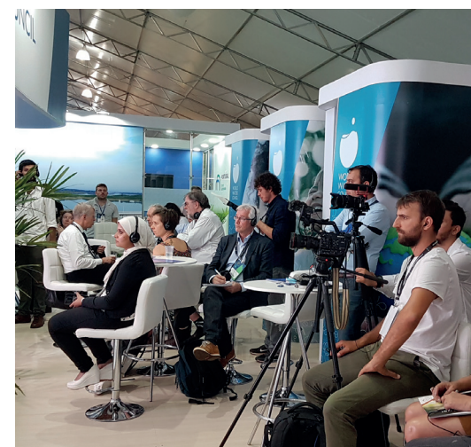
Journalists attend a press briefing at the Council pavilion