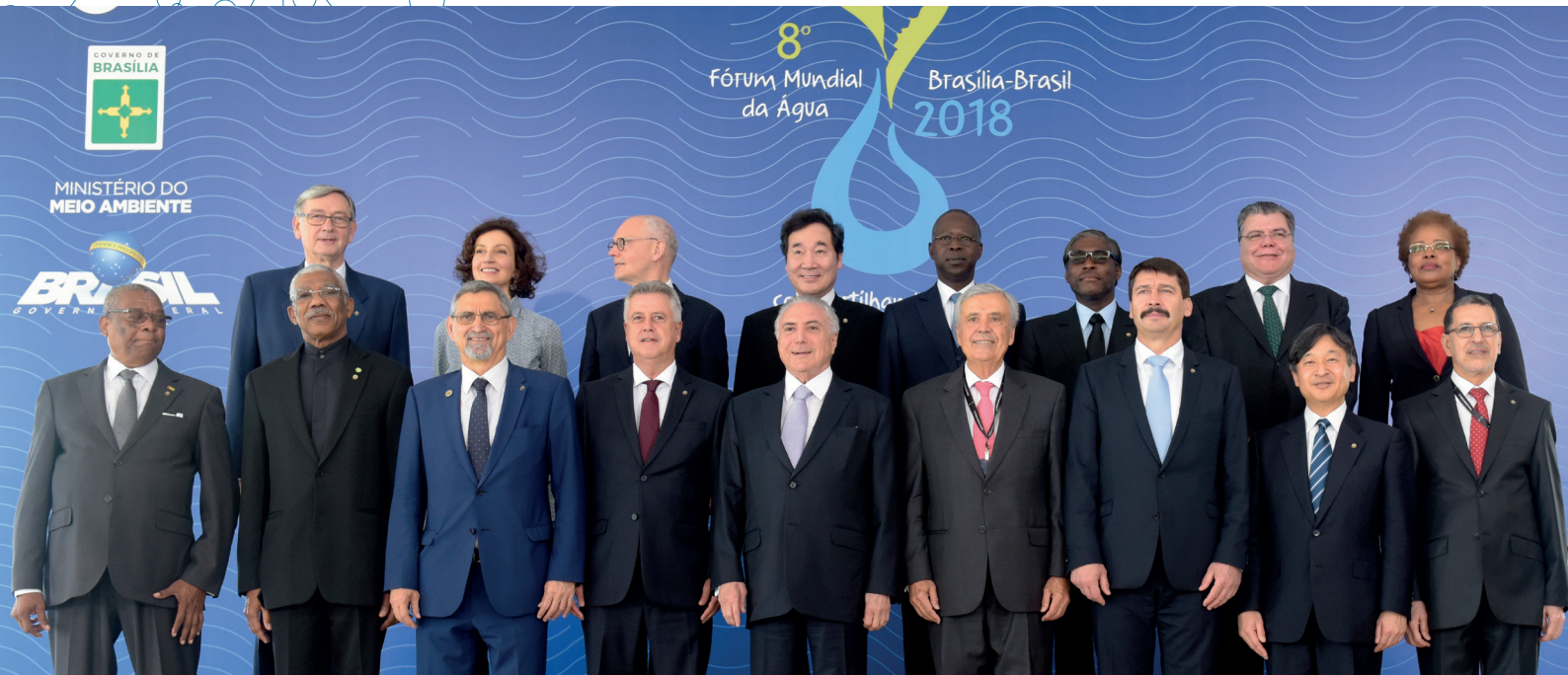
Opening of the 8 th World Water Forum. President of Brazil Michel Temer (center) welcomes Heads of State and the President of the World Water Council at Itamaraty Palace, 19 March

Report to the 65 th Board of Governors Meeting