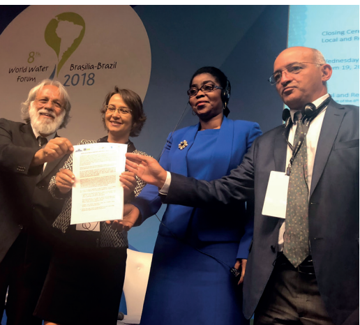
Top: High-Level Panel “Revitalizing IWRM for the 2030 Agenda”, 20 March; Center: Council Vice-President Dogan Altinbilek opens the #ClimateIsWater event on the Council pavilion, 21 March; Bottom: Participants in the International Conference of Local and Regional Authorities on Water share the Call for Action on Water and Sanitation, 21 March

For more photos of the 8 th World Water Forum go to https://www.flickr.com/photos/worldwatercouncil/albums